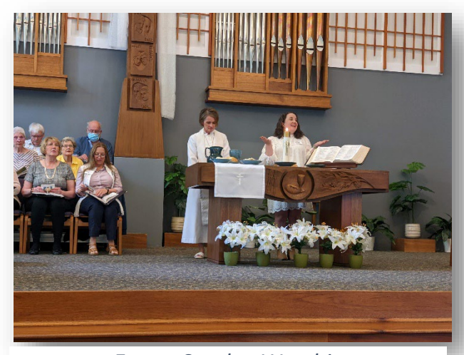
Easter Sunday Worship