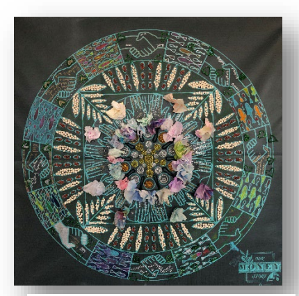
Our Money Story (from A Sanctified Art

The Finance Team participated in the Stewardship drive and conducted follow-up to ensure that everyone had an opportunity to complete a pledge as we move forward into 2023. The Team crafts a budget based upon many factors and makes adjustments to committee and team requests to formulate a budget proposal for the upcoming year.