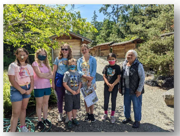
Trip to the Bainbridge Island Japanese Exclusion Memorial

up for the Juneteenth March and the Community Pride Celebration and the "Love Your Neighbor" rally, partnering with St. Michael's hospital to sign up folks for vaccine clinics, hosting a safe and fun neighborhood Trick or Treat event, and continuing to give much-needed funds and items to organizations in our community like KIAC, Coffee Oasis, and West Hills school.