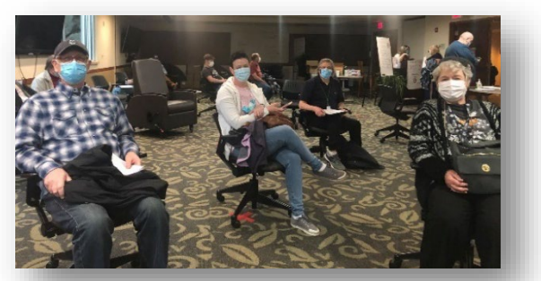
Waiting together after first vaccine