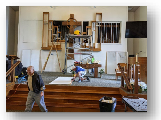
B&G Team replacing organ cloth