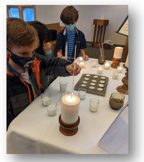
Candle station at Good Friday service