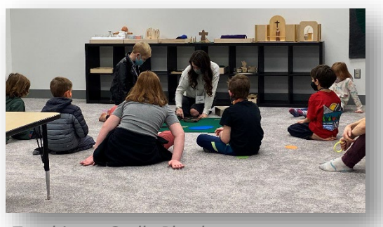
Teaching a Godly Play lesson

curiosity, and in opportunity. They know they are valued by our church and opportunities to participate in the life and ministry of the church allows them to feel their worth. The vision for Summit Kids also includes growth of impact. We envision more children participating in our spaces. We see our volunteer team growing as we scale to meet the needs of this essential ministry. I believe our community needs a thriving, healthy, ever-evolving church and Summit can meet that need. I have felt that gap filled in my own life, and seen the impact Summit has had on my family and children. Children and young families are the life-blood and future; knowing that