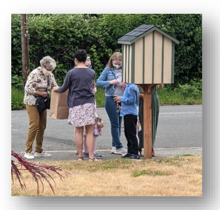
Stocking the pantry

offering was taken for Benedict House. Summit did not provide cooking assistance this year.