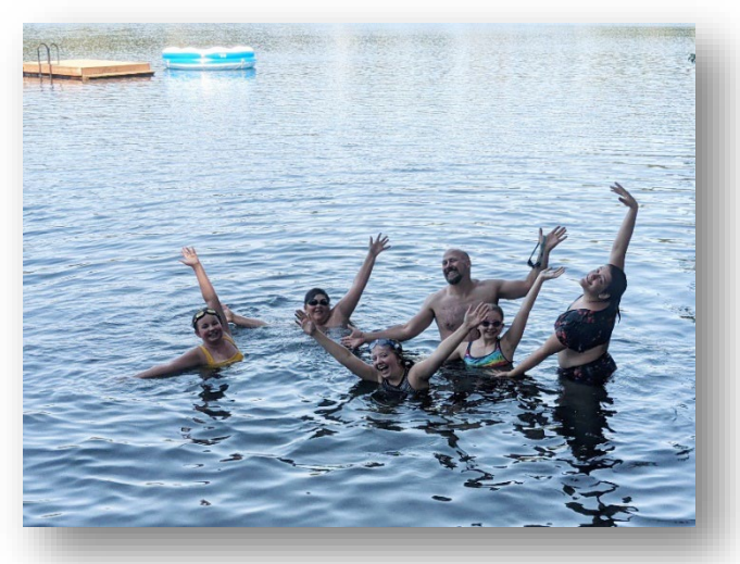
Great day at Benson Lake!

Thank you so much to our amazing Kids & Youth Team, all our staff and volunteers. The care and love you give to children and families has deep and lasting impact. We can't wait to see what God will do in this ministry in 2022.