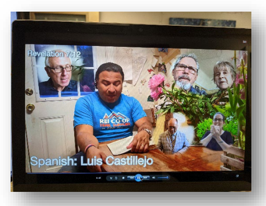
Pentecost Sunday Video

Then I spend time with some of the wonderful younger folks who have become part of our Summit family and I realize that it is the responsibility of this old dog to learn some new tricks. Our faith, our worship life and our communication styles need to make sense in the present, not the past, if we are to share the gospel in a real and meaningful way.