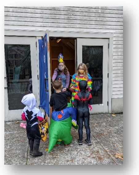
Trick or Treat!