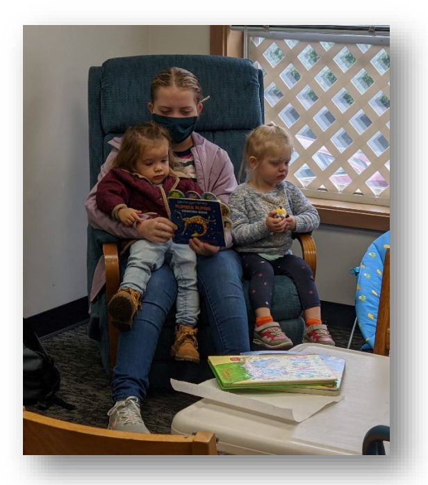
Little ones enjoying a story in the nursery

Adult Groups: 123 Youth: 15 Summit Kids Godly Play: 17 Nursery: 7