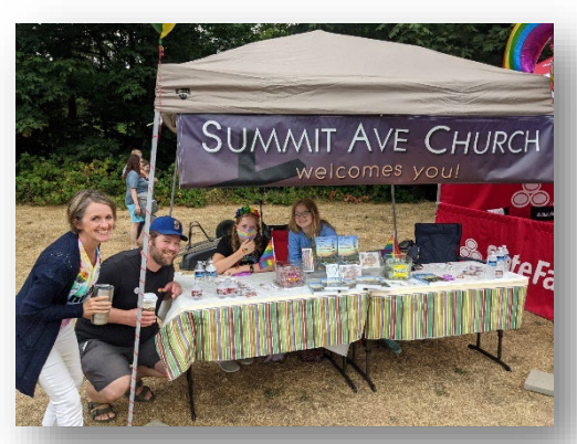
Smiles and fun at Kitsap Pride

Mission Statement: To further our church mission of growing disciples in all generations. The Missions/Outreach Team plans and leads the congregation in serving others locally, regionally, and internationally.